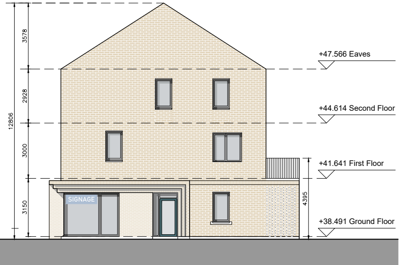
DUPLEX BLOCK F SIDE ELEVATION (WEST)