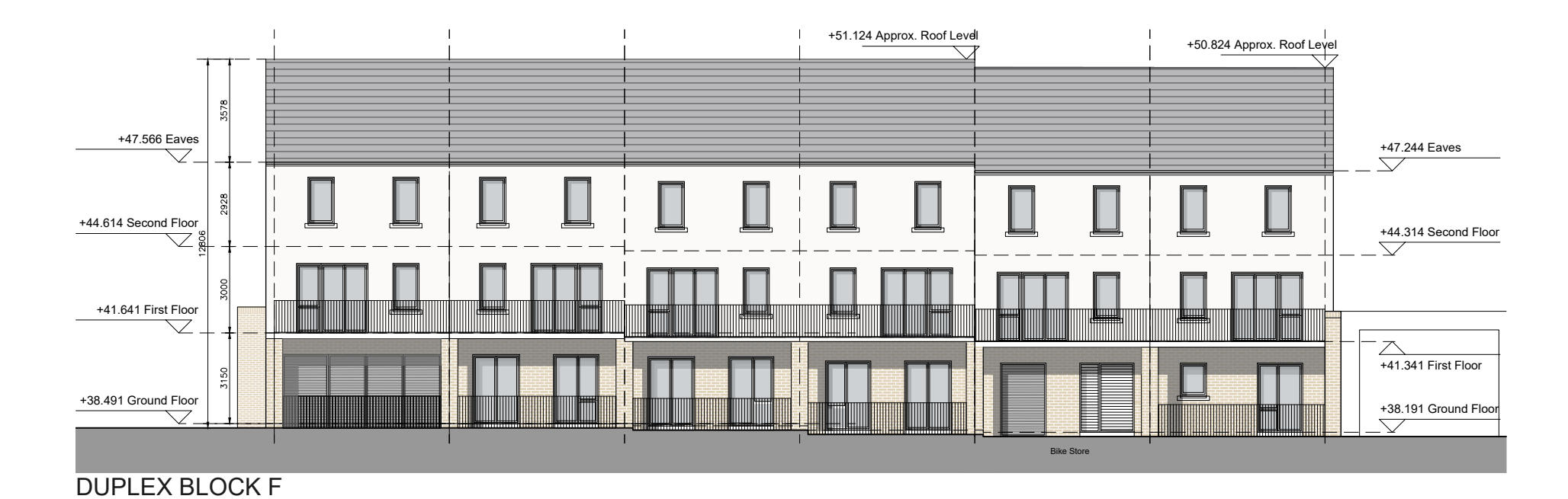
Approx. +51,124 Approx. +50,824