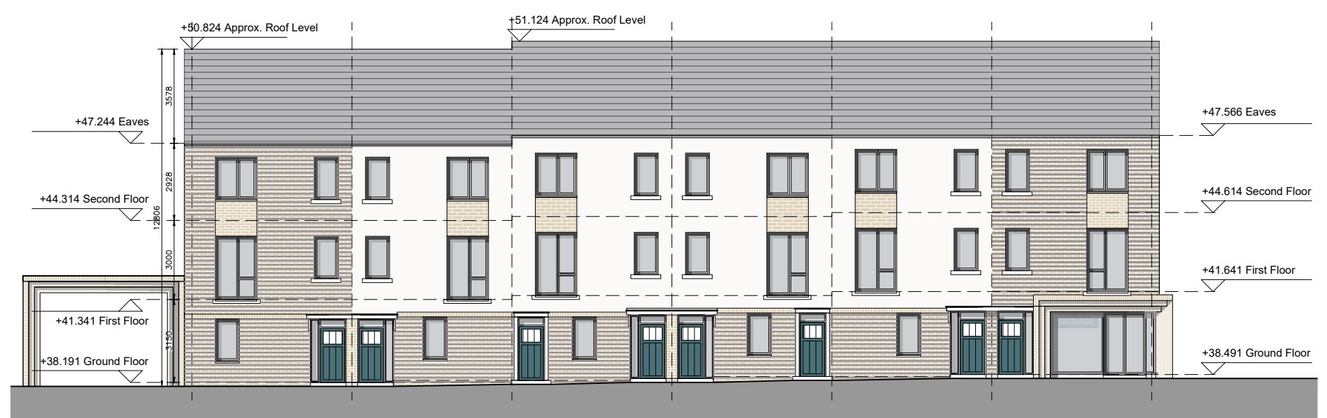
DUPLEX BLOCK F FRONT ELEVATION